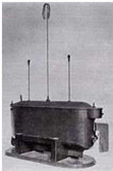
Tesla R/C submarine 1898