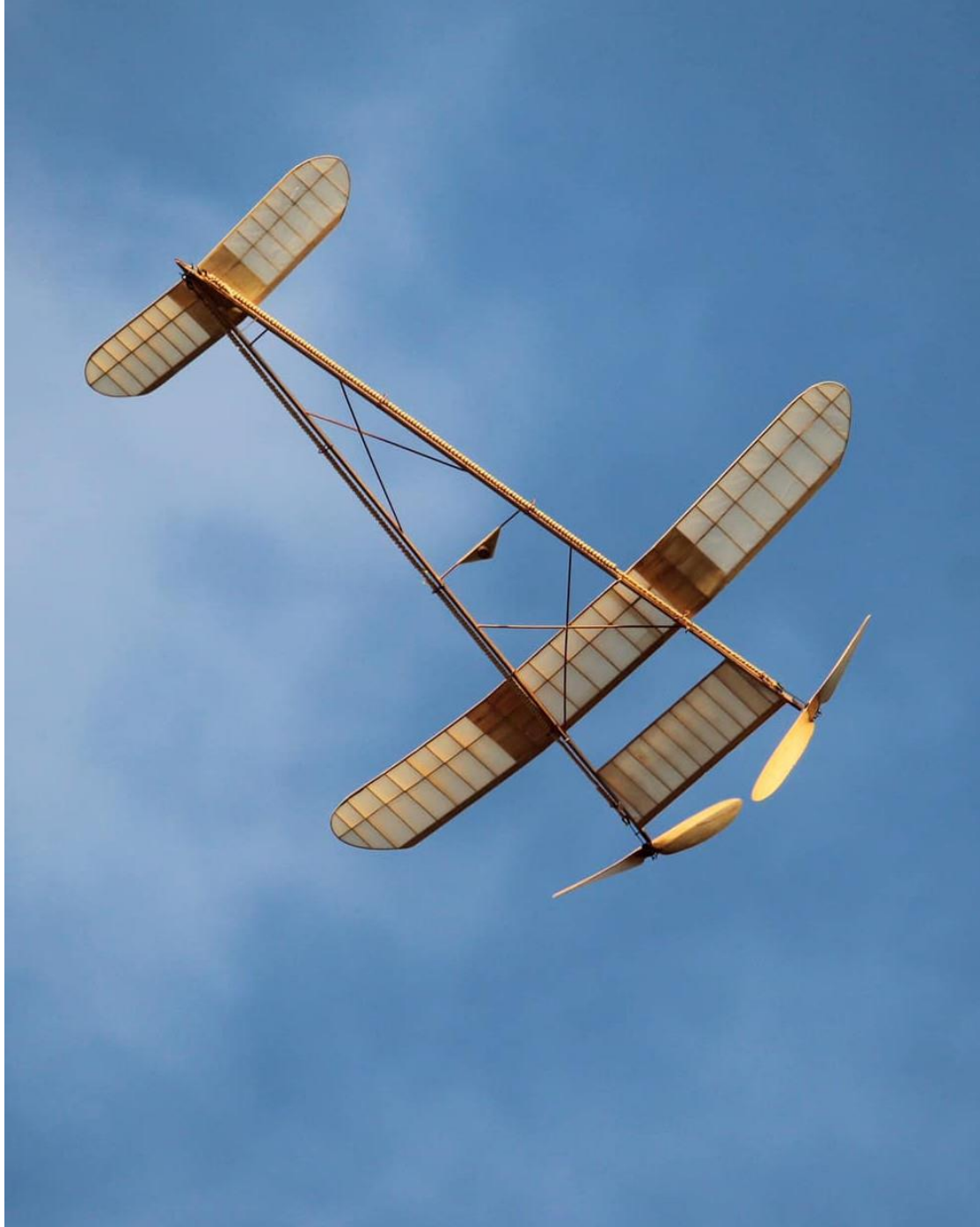
Roy's A Frame pusher flying at the Unorthodox Day