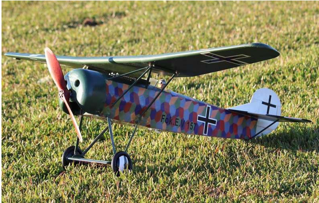
Pics beginning from Scale Judging Day Friday 3rd July