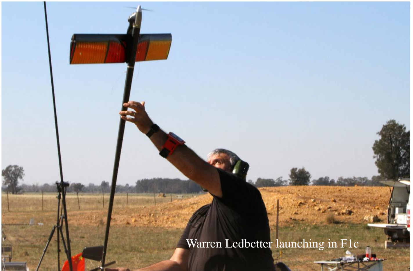
Warren Ledbetter launching in F1c